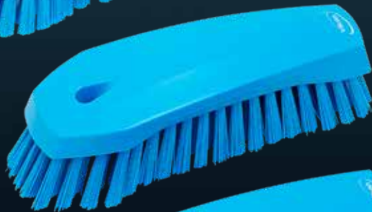
3587x Hand Brush M