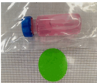
View of content (1mm x 1mm scale)