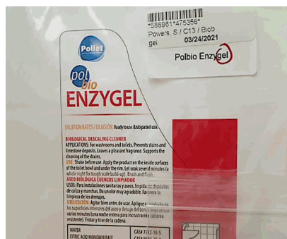
Package received - labeling COC

Laboratory Number Beta-586961 Percent modern carbon (pMC) 85.43 +/- 0.2 pMC Atmospheric adjustment factor (REF) 100.0; = pMC/1.000